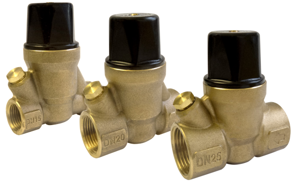
PRV15, PRV20, PRV25

The RMC PressureGuard® Compact Pressure Reducing Valve is used in water systems to limit the downstream pressure to the preset maximum. Easy serviceability and robust design makes the PressureGuard® a premium valve on the market.