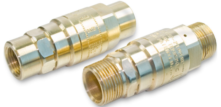
PSL50 and PSL75

RMC's PSL Pressure Limiting Valves regulate the inlet supply line pressure to a preset maximum preventing over-pressure situations. PSL Pressure Limiting Valves are ideal for installation with high pressure storage water heaters, water meter assemblies, water softeners etc.