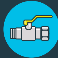
Valves and Taps