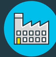
Industry Specific Applications