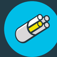
Tubing and Accessories